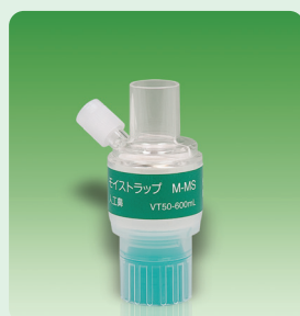
Moistrap M-MS (straight type)