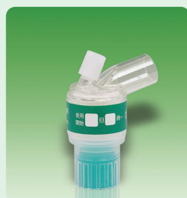
Moistrap M-MB (bent type)