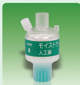
Moistrap M-LS (straight type)