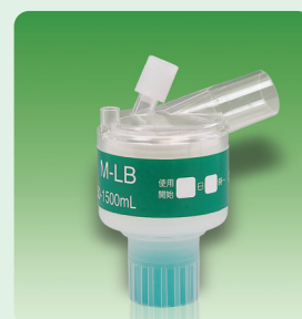
Moistrap M-LB (bent type)